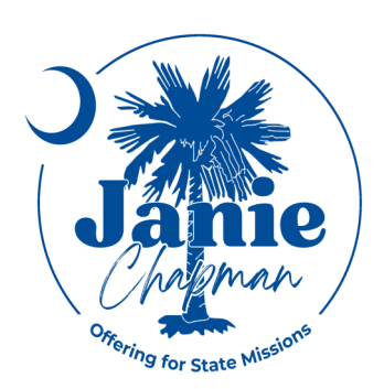
Our Goal: $6,000

Thursday, September 26 We will leave at 9:15 am from the Crosswalk parking lot and travel to Grandad's Orchard in Hendersonville with lunch to follow.