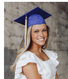
Abbey League Travelers Rest High School