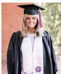
Reagan League Clemson University